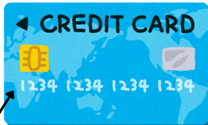
Card front Side